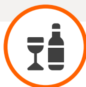
Liquor Store & Bottle Shops