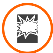
Comic Book Shops